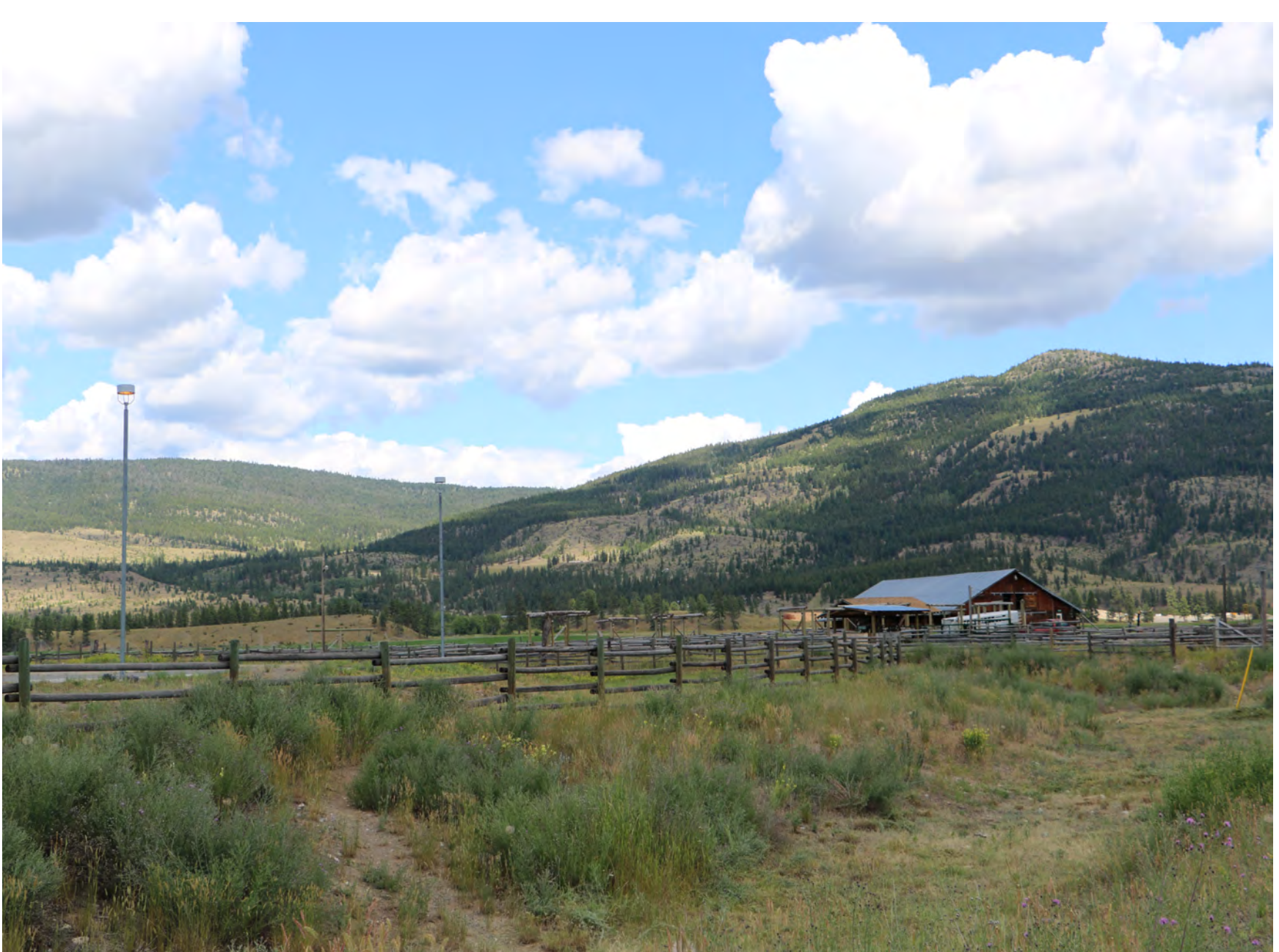
STEP 4 The Project Team will consider research and community input to make recommendations to the LNIB Lands Department for developing guidelines for decisionmaking about traditional holdings. These recommendations will be presented to the community for feedback, and will inform a LNIB Allotment Law under our Land Code.