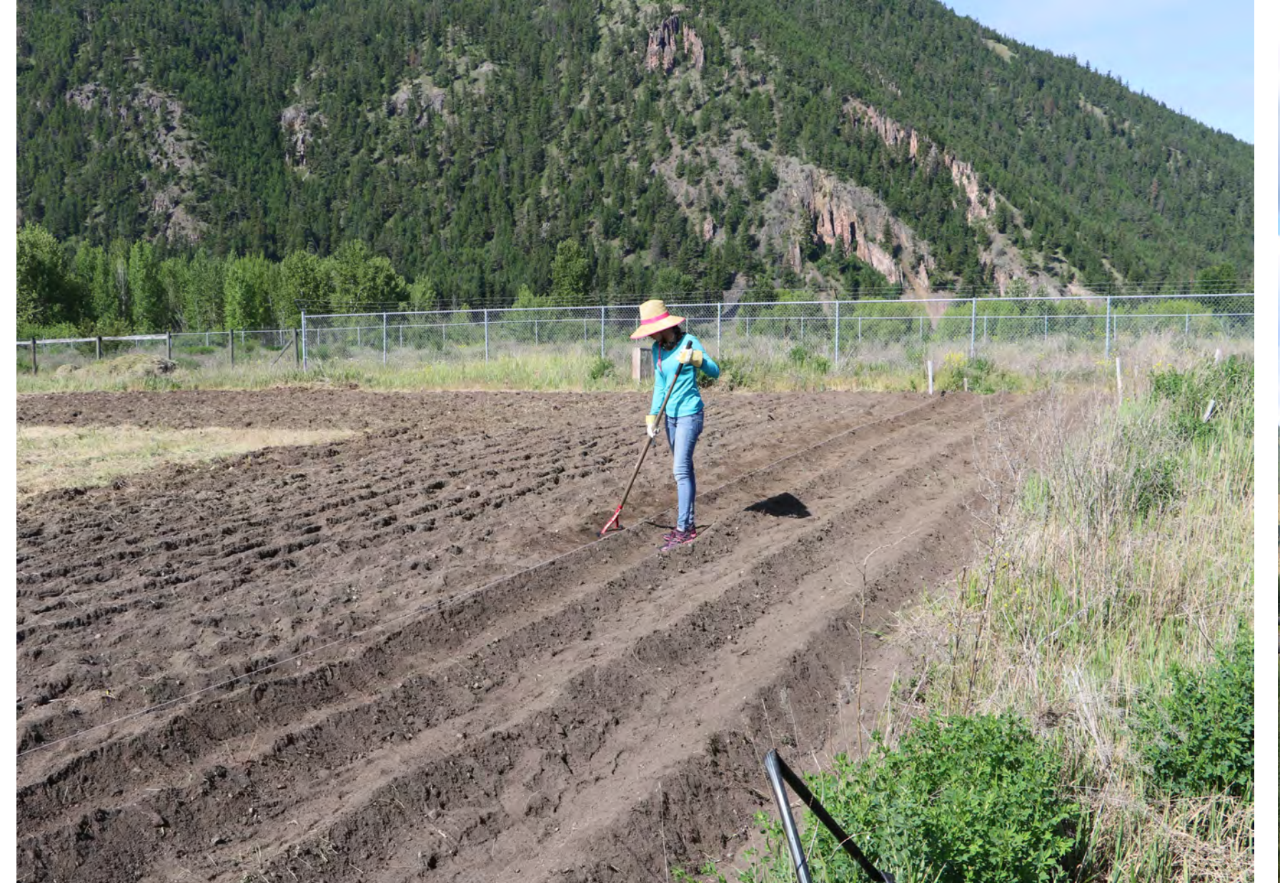
STEP 3 Meet with LNIB families and community members to learn about their connections to the land, and about family decision-making processes in the past and today. Seek advice on resolving unregistered claims.